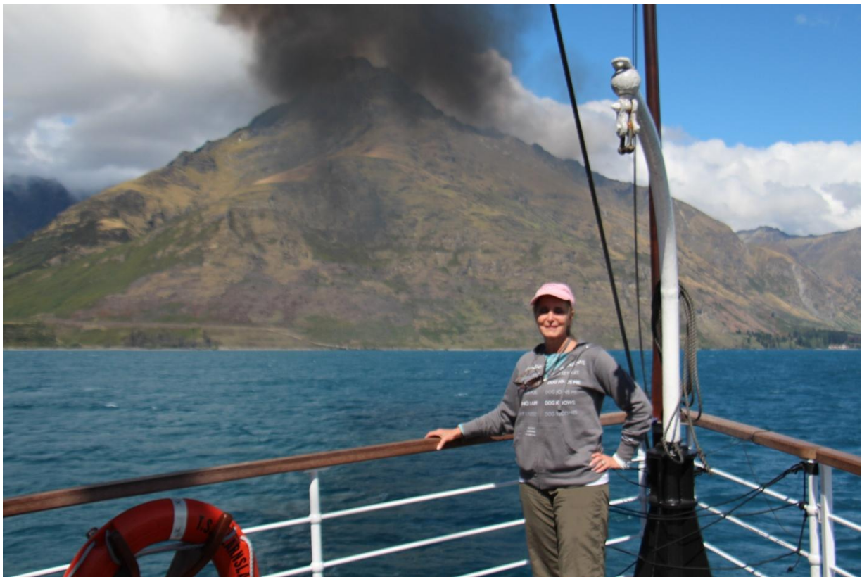
(For those of you who are doubters, the smoke is from the steamboat.) When we landed back at the dock we made tracks to Patagonia, a gourmet ice cream and chocolate parlor.